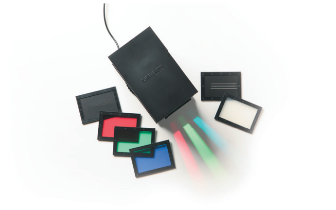
Example equipment drawers from SEPUP Issues and Science for California