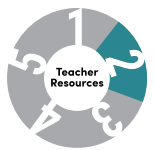
Driving Questions Board

In SEPUP, the Driving Questions Board elicits students' initial wonderings about the unit issue and the investigative phenomena. Throughout the unit, the class is prompted to revisit the Driving Questions Board. Students may generate and answer questions, such as: How are the cells of various organisms alike? How are they different? How do these similarities and differences relate to the functions of these cells? Ideally, student questions generated at the start of each learning sequence can be condensed through class discussion into a unified driving question. As a scaffold to teachers who are new to this teaching strategy, Driving Questions cards are provided for each learning sequence and can be displayed as the unified driving question.